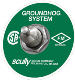
Scully Ground Bolt