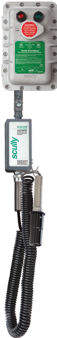
Scully Groundhog Control Monitor with Plug and Cable