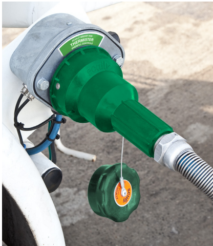
One Connection for Overfill Prevention and Grounding

The Groundhog requires that each vehicle be equipped with a specially designed Scully electronic ground ball or bolt. Before the loading operation can begin, the controller must see an intelligent return signal from the ground ball or bolt, indicating that a proper grounding connection has been made.