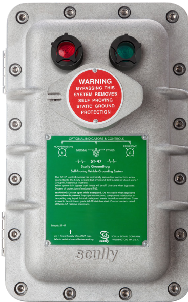
Groundhog Ground Verification System

Featuring Dynacheck® – Automatic and Continuous Self-Checking Circuitry