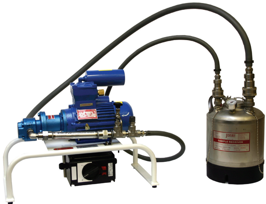
JISKOOT MS53 LabMix laboratory sample mixing system.

The laboratory mixer consists of a pump-driven loop that draws fluid from the lowest point of the receiver, pumping it through a static mixer and returning it back to the receiver. When returning the fluid back into the receiver, internal spray bar jets sweep the wall and base to induce swirl. A takeoff valve is provided to draw off the mixed sample and deposit it directly into laboratory glassware. An optional septum can be provided to enable a syringe to draw off fluid directly from the mixing loop for use with lab analyzers. Typical mixing times range from 5 to 20 minutes, depending on the sample volume and type of oil. The JISKOOT MS53 LabMix system is fitted with keyed connectors to help prevent spillage and operator errors. Additionally, adapters can be supplied to allow interconnection with other sample receivers.